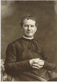
A favourite photo of Don Bosco

The Sacred Scriptures offer us understandings of the God who never fails us and the conditions for response by men and women. For example, the Bible has pages for times of vocation difficulty or sterility. The episode of Samuel for instance. It was a time of decay of religious institutions, everyone's attention was focused on war and even the prophets were forgotten. There were no models of vocation to follow - yet God spoke directly to the heart of a boy to make him his witness and spokesman.