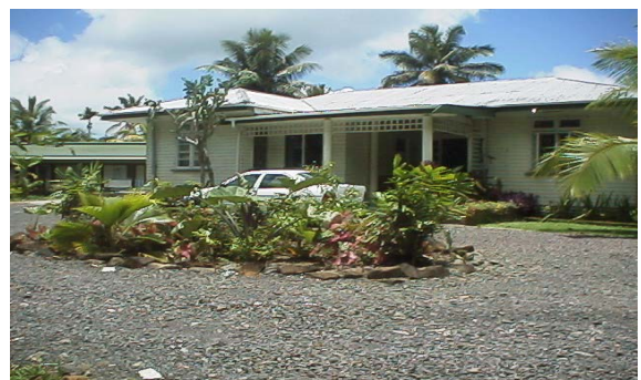
Don Bosco House Suva Fiji

very open, involved in the local community.