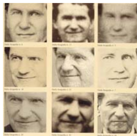
The many faces of Don Bosco

in spiritual potential and give indications of an apostolic vocation. We help them to discover, accept and develop the gift of a lay, consecrated religious or priestly vocation, for the benefit of the whole Church and of the Salesian Family. With equal zeal we nurture adult vocations". (C. 28).